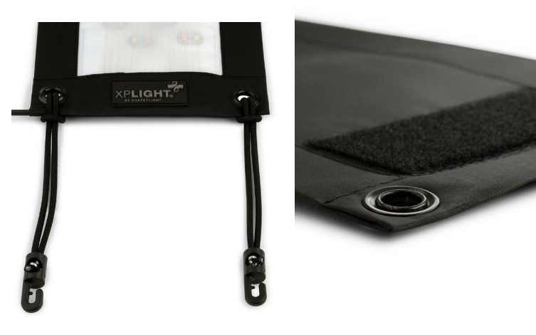
Easy to hang with eyelets, Velcro or Bungee cords.