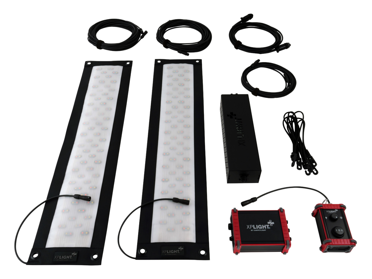
XPLight Tentacle 640 Set 2 with 2 lights