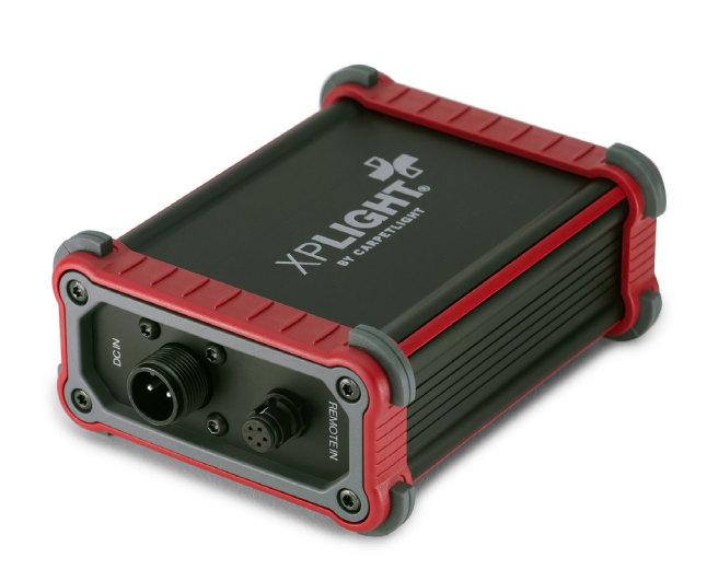
Can be operated with all 24 volt connections. Up to 3 lights simultaneously.