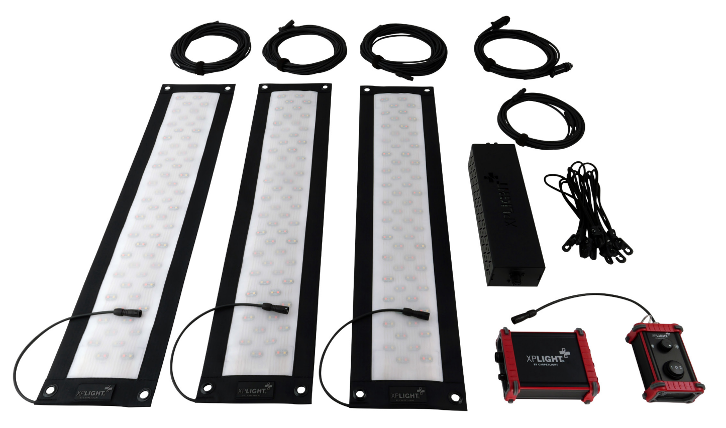
XPLight Tentacle 640 Set 3 with 3 lights