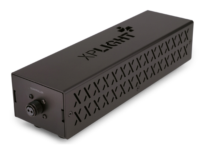
The power supply is waterproof and supplies 24 volts.