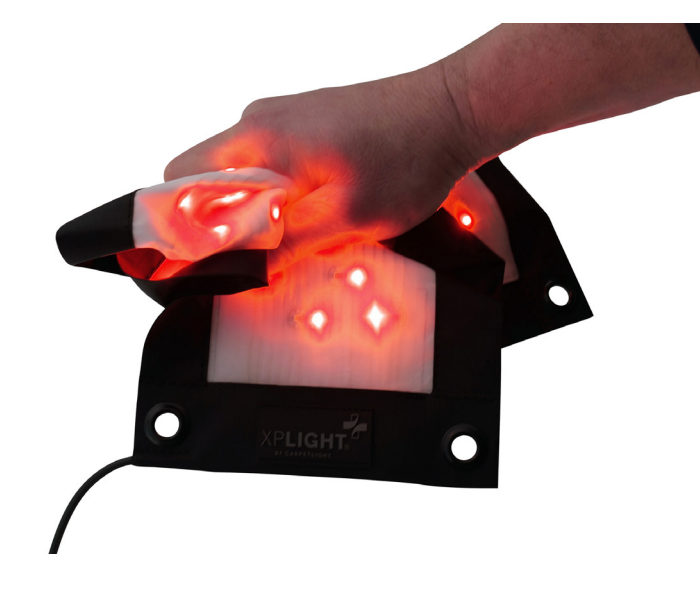
Can be bent and crushed over 20.000 times, IP67, with white and red light.